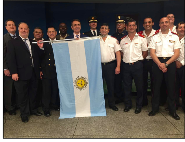
Commissioner Trantalis welcomes firefighters from Argentina during the opening ceremonies of the Fort Lauderdale Fire Expo at City Hall.