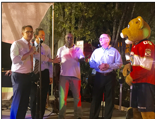
Vice Mayor Trantalis introduced city commissioners during the annual Neighbor Support Night at City Hall where the work of city departments is showcased.