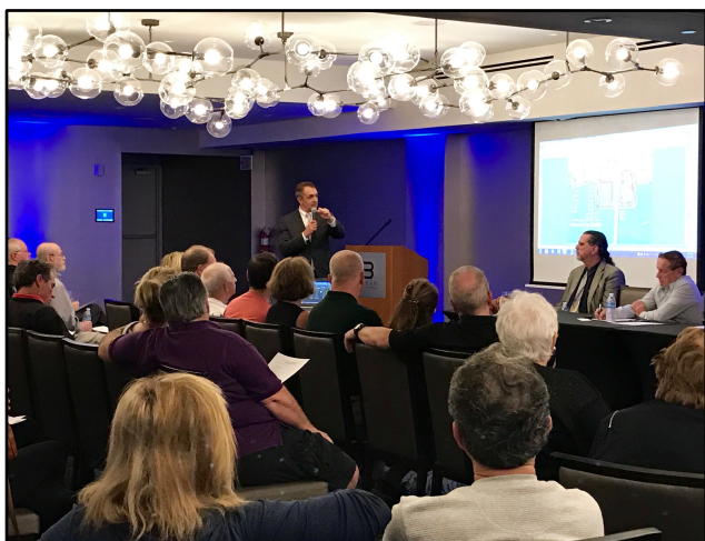
Vice Mayor Trantalis discussed various beach redevelopment projects during the January meeting of the Central Beach Alliance at the B Ocean Hotel.

After the parade, head to the festival at Huizenga Plaza and along Riverwalk. There will be live bands, cultural attractions, Irish dancers and a special Kids Zone.