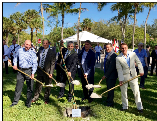
Vice Mayor Trantalis and the rest of the City Commission joined the consulate general of Israel from Miami in planting a tree at Holiday Park in honor of Tu B'Shevat.