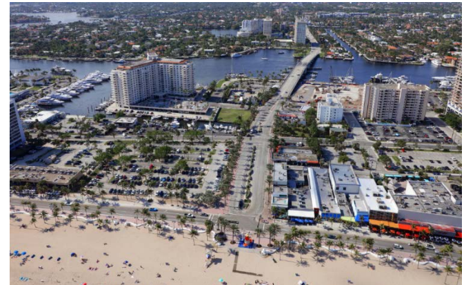
Oceanfront Plaza and E. Las Olas Blvd. (Festival St.)