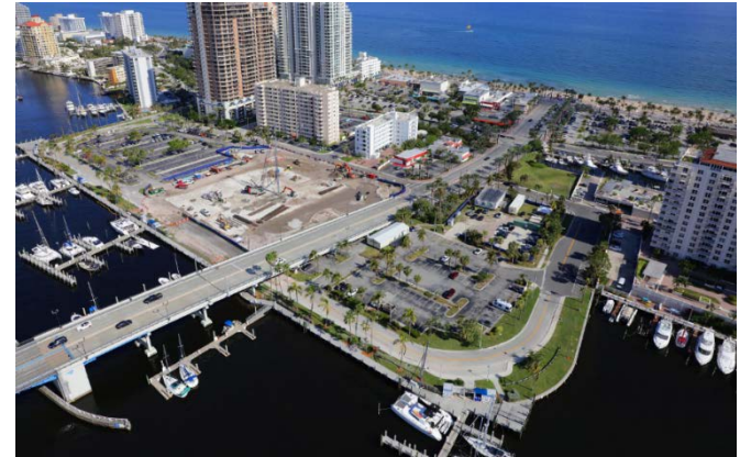
North and South Lot