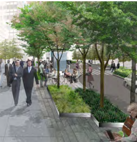
Strong Corner Presence at Main Street Intersection in Central Business District / Downtown Core: