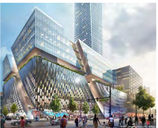
Quality Materials and Architectural Treatments