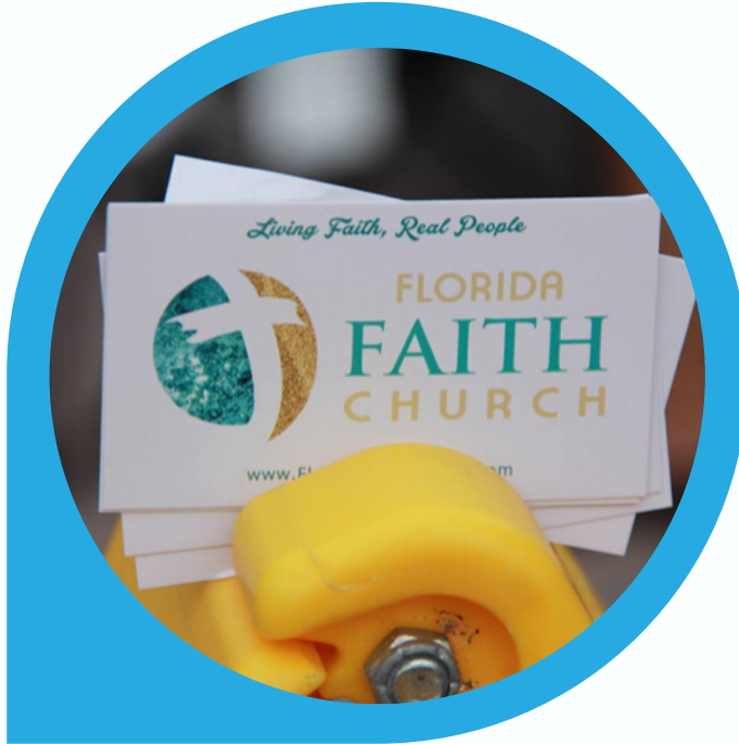
Faith Based Groups Resident Associations