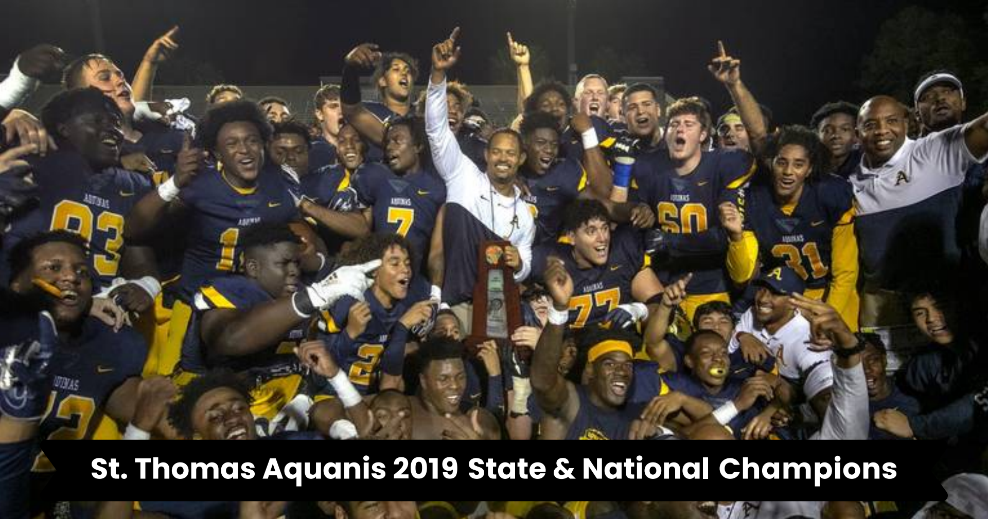
St. Thomas Aquanis 2019 State & National Champions