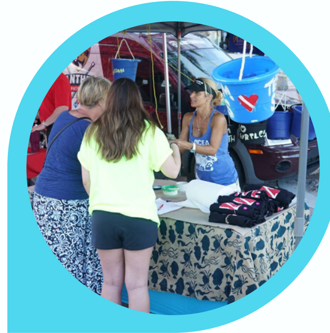
Non-Profits Environmental Groups