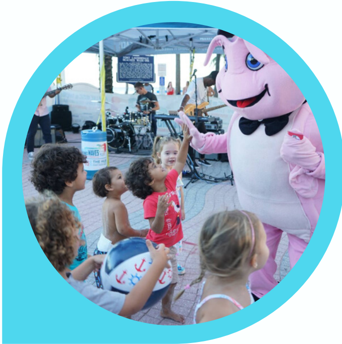
Beach Businesses Hotels / Rest. / Merch.