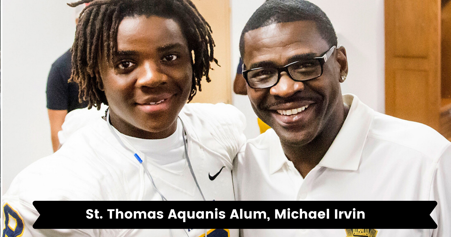
St. Thomas Aquanis Alum, Michael Irvin