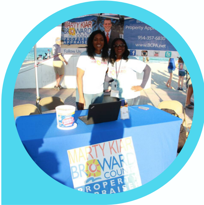
City Agencies Sponsors