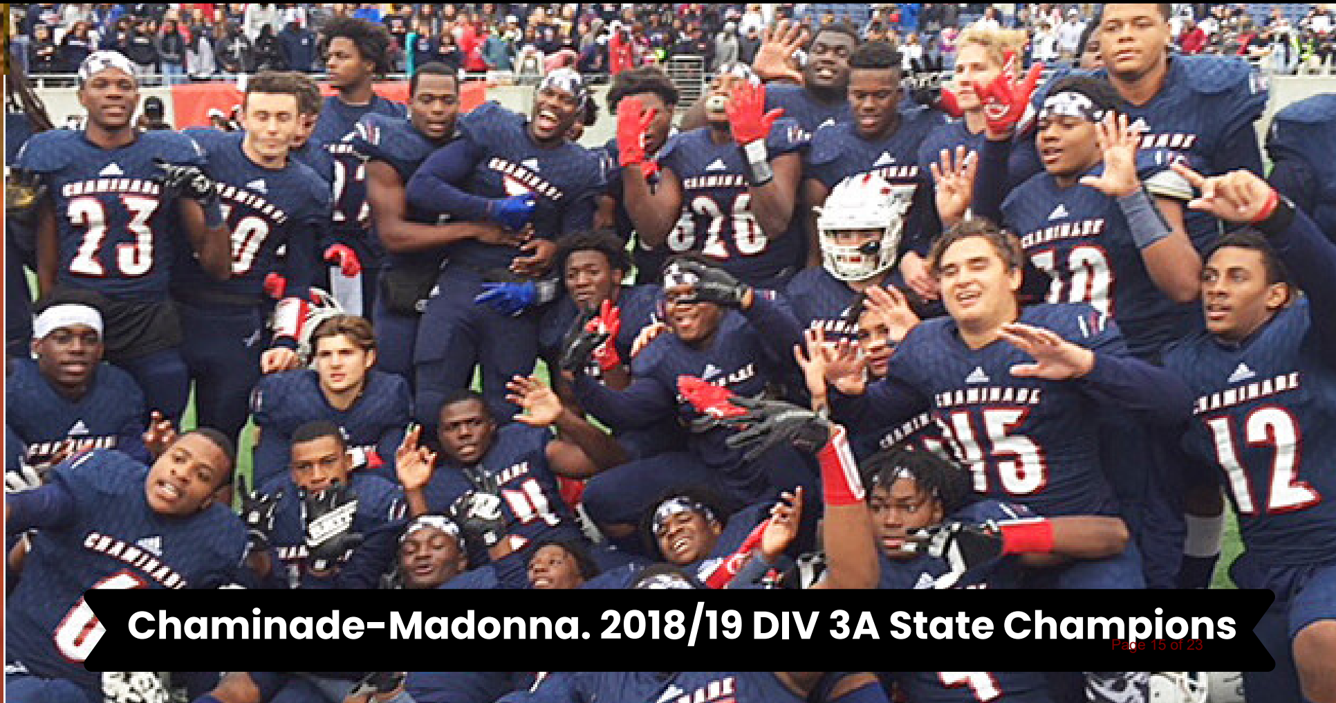
Chaminade-Madonna. 2018/19 DIV 3A State Champions