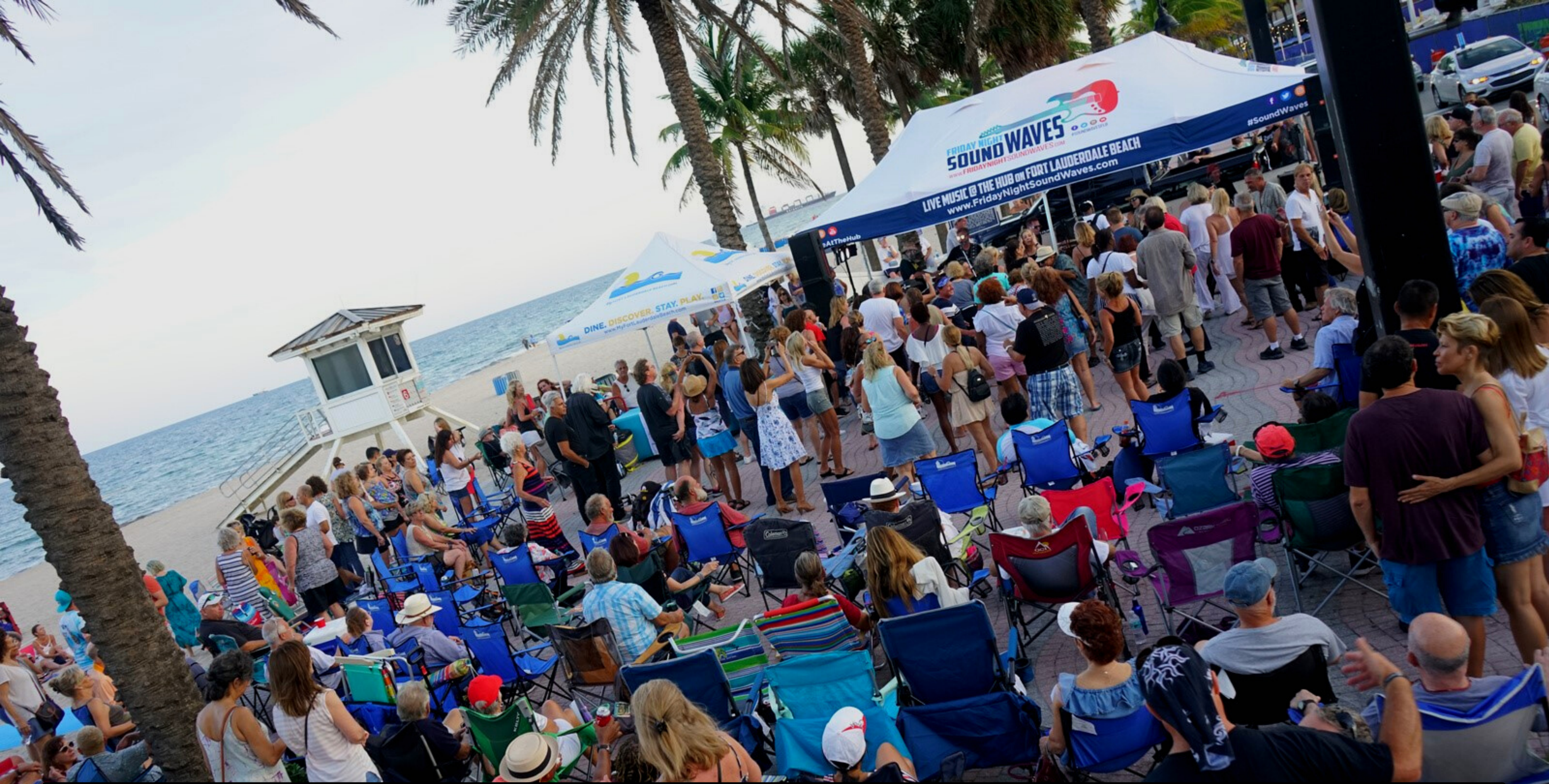
FRIDAY NIGHT SOUND WAVES, SEASON 5: FREE, LIVE & LOCAL MUSIC. SPONSORED BY THE FORT LAUDERDALE BEACH BUSINESS COMMUNITY