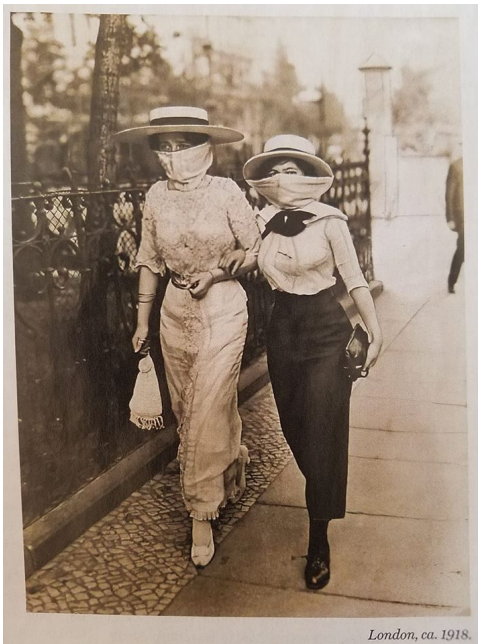
London, ca. 1918.

102 years ago and they understood the importance of wearing a mask.