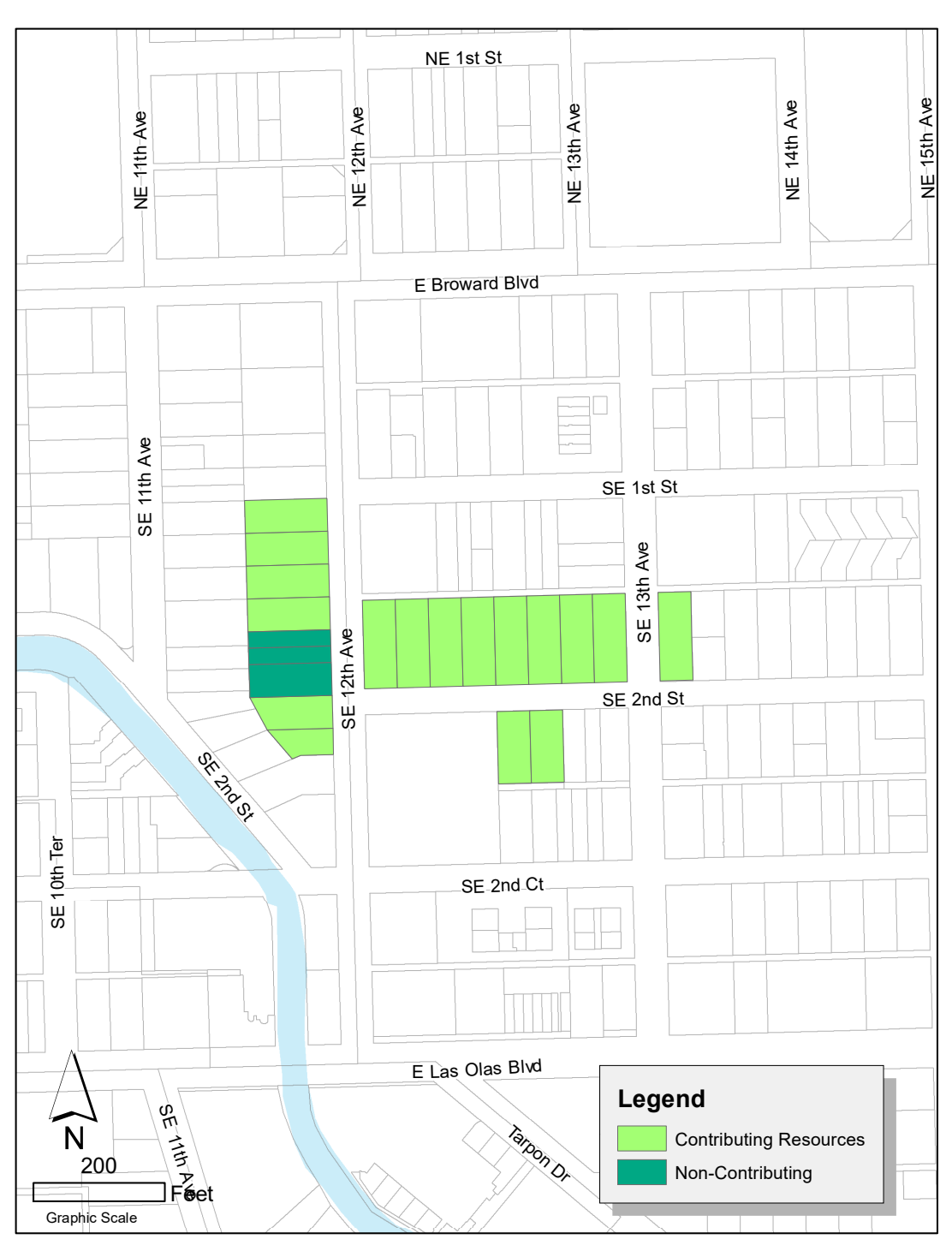
NORTHWEST RESOURCES MAP