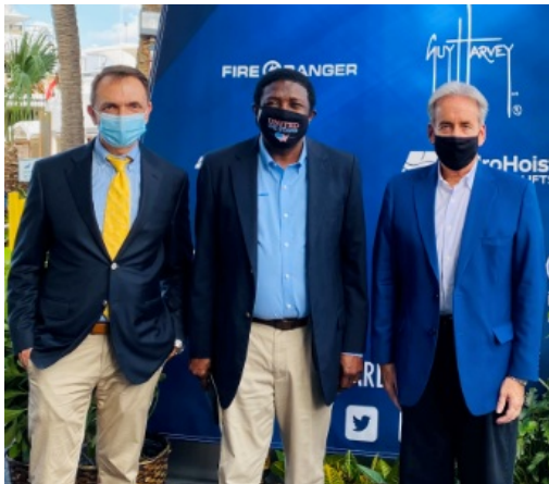
With Mayor Dean Trantalis and County Mayor Dale Holness

📅 October 28 - November 1, 2020 📍 801 Seabreeze Blvd, Fort Lauderdale, FL 33316