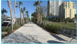
Downtown Mobility Hub