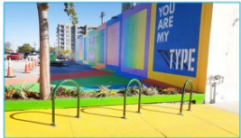
New bike parking facilities along the Flagler Greenway

LauderTrail – LauderTrail is a City Commission-led initiative to create a continuous and comprehensive network of connected urban trail facilities. The trail is expected to connect 17 neighborhoods, 26 parks, 11 K-12 schools, 7 entertainment districts, 14 government services, 3 higher education centers, over 30 cultural centers, 30% of City jobs, and 30% of City residents. In December 2020, City staff identified the PATH Foundation as the not-for-profit trail organization to lead the City's trail masterplan process. The masterplan is scheduled to start in February 2021 and is expected to take 8-10 months to complete.