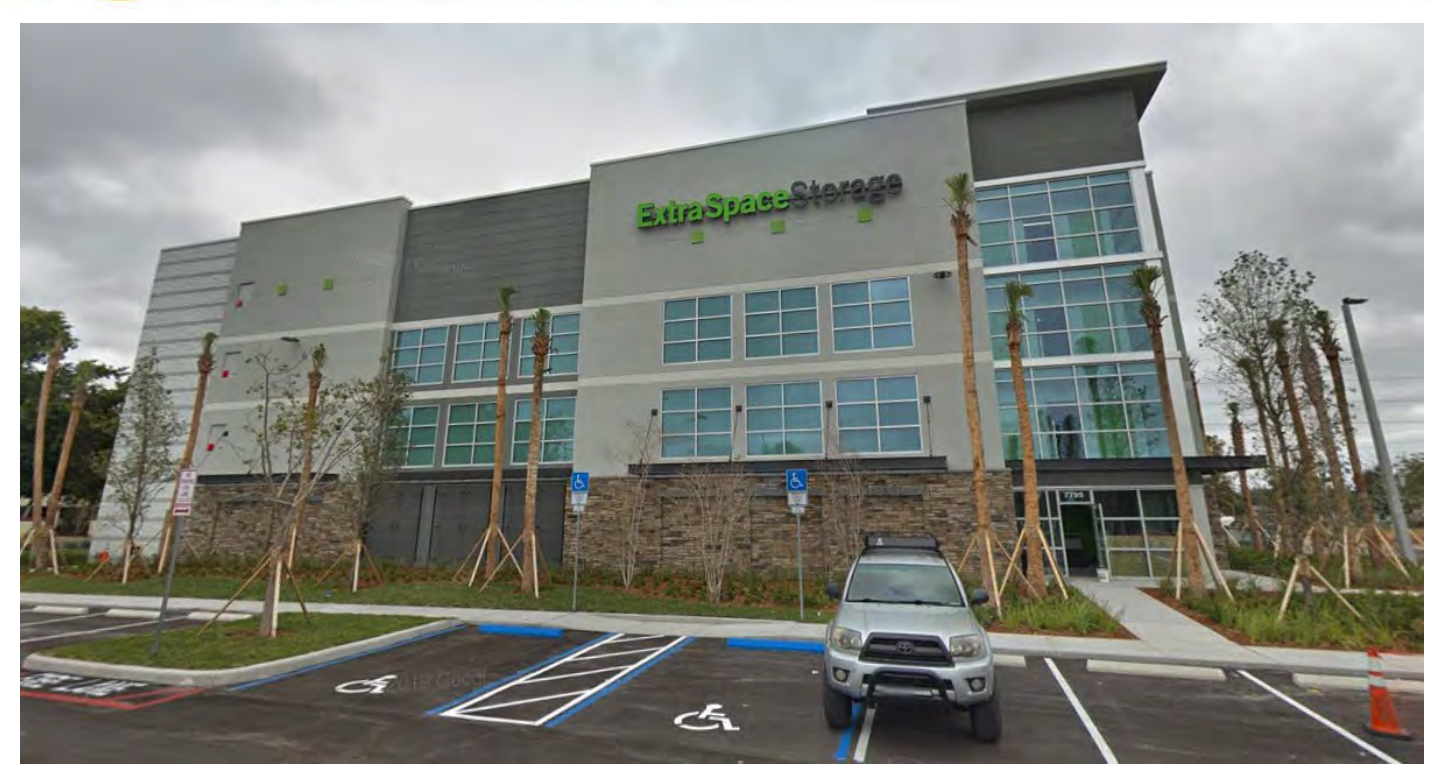
Exhibit 2: 4551 W Sunrise Blvd, Plantation, FL 33313