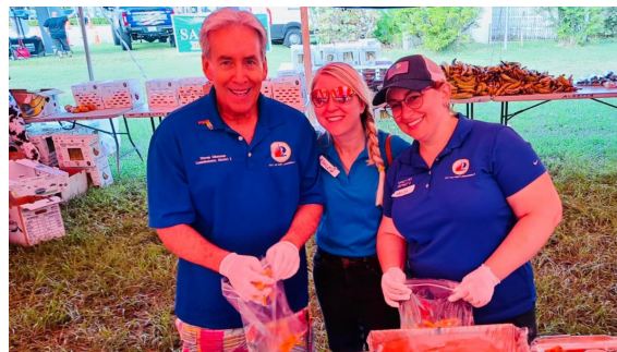
Our first team photo!

As we reflect on the holiday season, it is essential that we remember what's important and what we have to be grateful for. We certainly had the opportunity to appreciate what we have during the 6th Annual Grocery and Turkey Giveaway, where over 2,500 turkeys were given to people facing food insecurity and 4,900 people in need were served with groceries to help them prepare for Thanksgiving.