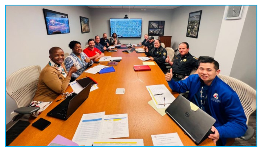
Housing Opportunities Project Team meeting to develop annual plan

One component of the initiative is the Community Court Program and the accompanying support services whose goal is to provide permanent solutions to homelessness. The City will continue with key organizations, which include Broward County and the TaskForce Fore Ending Homelessness to explore collaborative programs