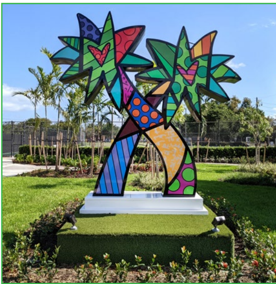
Sculpture by Romero Britto