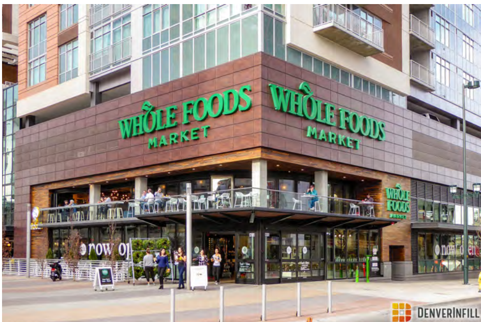
Accentuate Corner Elements