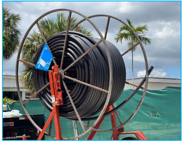
Conduit used for underground FPL lines

If you would like this publication in an alternate format, please call 954-828-4755 or email strategiccommunications@fortlauderdale.gov.