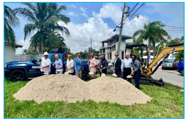
Las Olas Isles utility undergrounding groundbreaking ceremony

To learn more about this initiative, visit <u>www.fortlauderdale.gov/</u><u>undergrounding</u>.