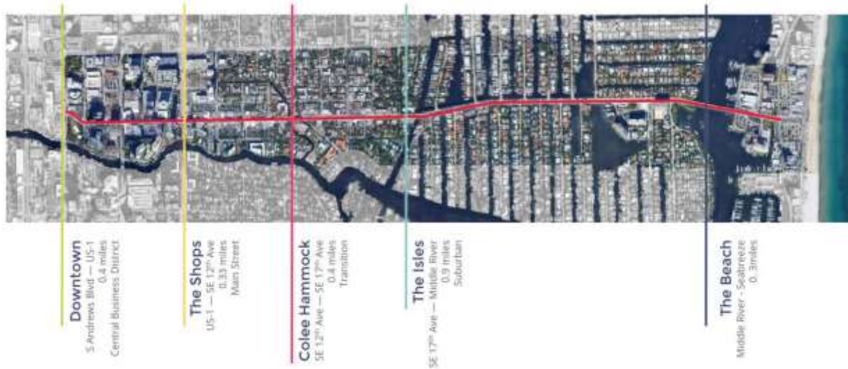
Figure 1- Character Areas

The geographic distinction of character areas also applies to the identification of the proposed improvements and the cost associated with the improvements. This analysis will rely on the findings in the Plan with regards to what improvements are needed where and at what cost.