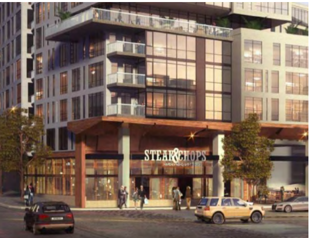
Corner Design with Rich Layering of High Quality Materials

For more information, refer to the complete Downtown Master Plan Design Review Team (DRT) Comment Report attached.