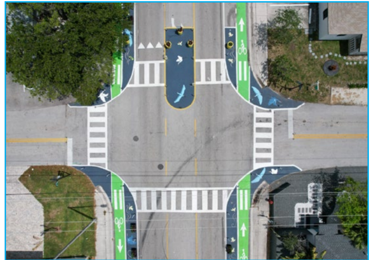
NE 15th Avenue after improvements

Speeding vehicles. Narrow sidewalks. No bike lanes. Not enough crosswalks. Residents of the Lake Ridge neighborhood were concerned about these issues and what it meant for the safety of pedestrians and cyclists along NE 15th Avenue. At the time, the roadway had four lanes for vehicles and little else for those who walked or biked in the area, creating a barrier in their community.