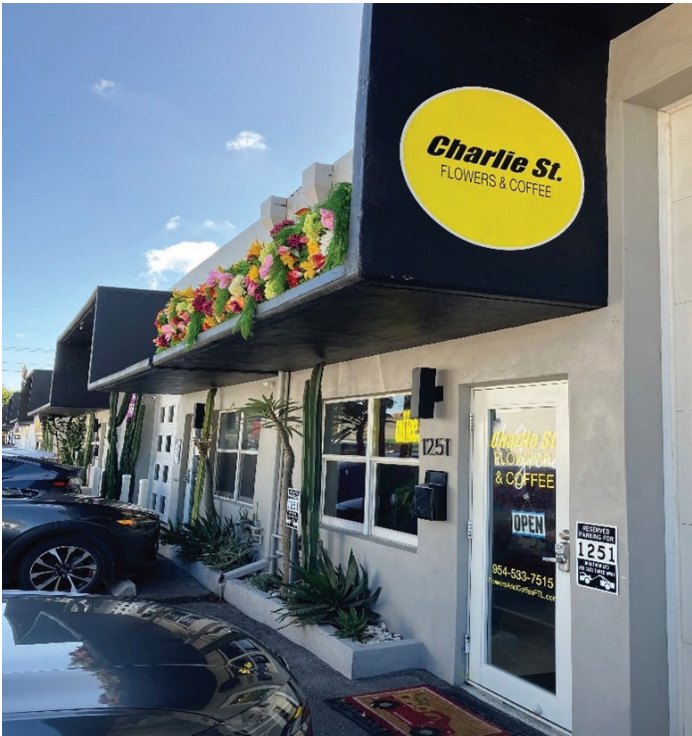
850 NE 13 Street Small Business