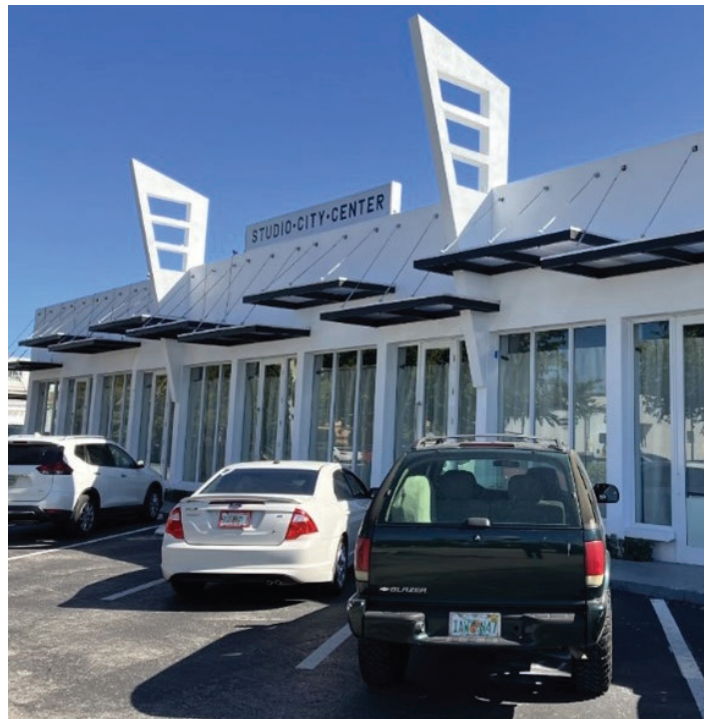
850 NE 13 Street - After Renovations