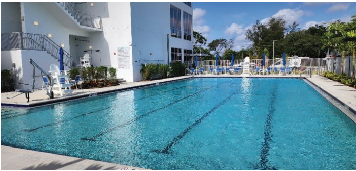
L.A. Lee YMCA/Mizell Community Center Swimming Pool