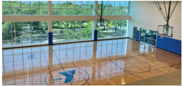
L.A. Lee YMCA/Mizell Community Center YMCA Gym

feet and is home to YMCA traditional programming, Broward College, and ground floor retail. Additionally, various amenities are available for public use including gymnasium/basketball court, outdoor swimming pool, preschool, Black Box Theatre, multi-purpose space, and business incubator.