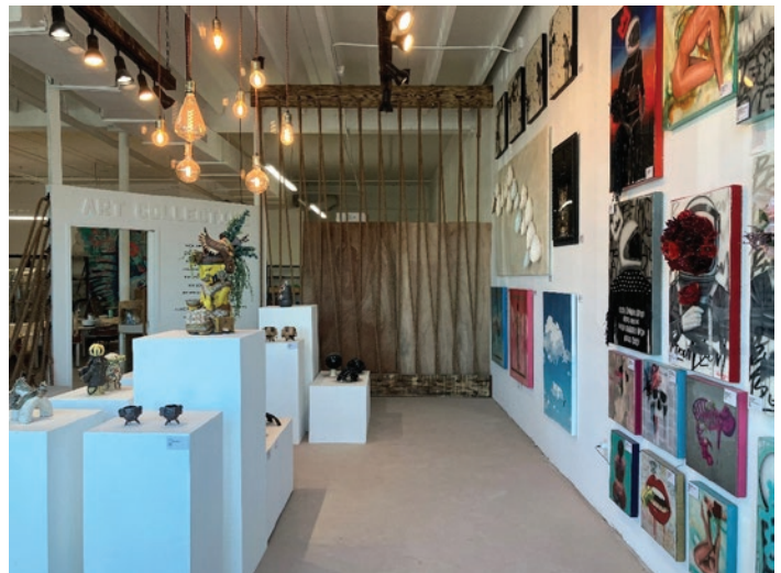
Mingo Pottery Studio at 800 NE 13 Street