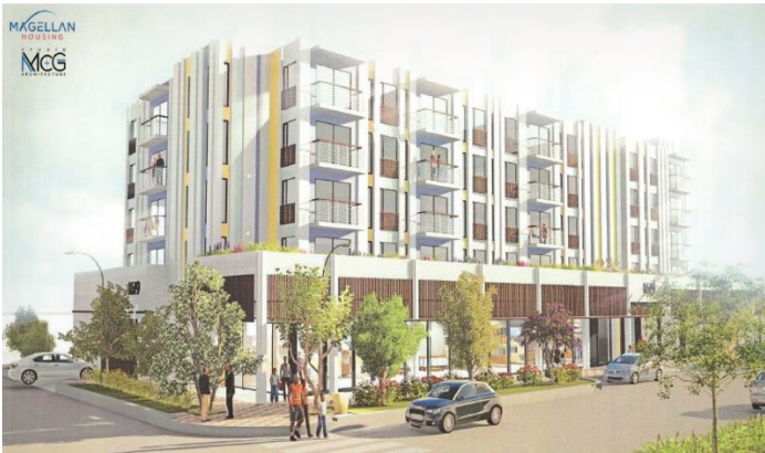
Rendering of The Laramore project

affordable housing and restricted to tenants that make at or below 60% AMI with a 30-year affordability term.