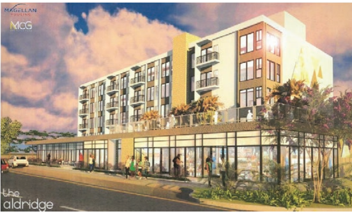
Rendering of The Aldridge project