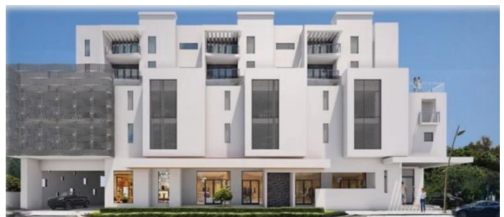
Rendering of Wright Dynasty, LLC mixed-use project