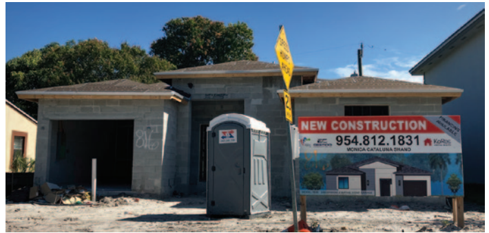
Construction of scattered site infill housing