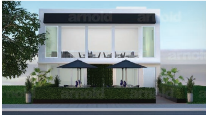
Rendering of Food and Friends Southern Comfort Kitchen and Bar located at 1310-1312 Sistrunk Boulevard