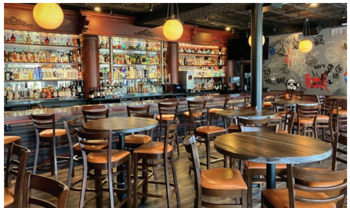
Completion of Patio Bar & Pizza