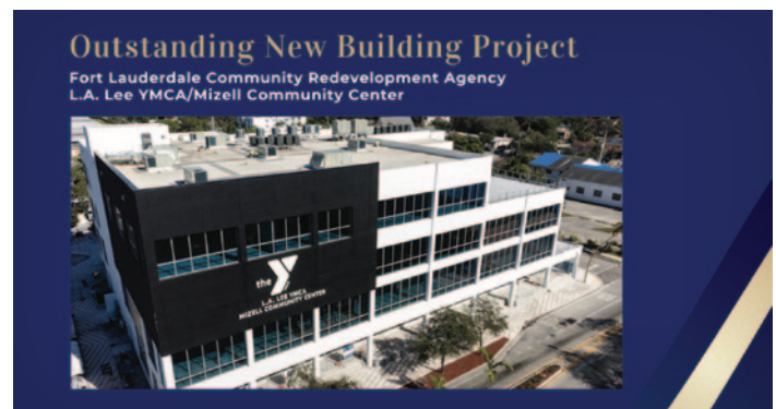
L.A. Lee YMCA/Mizell Community Center for Outstanding New Building Project