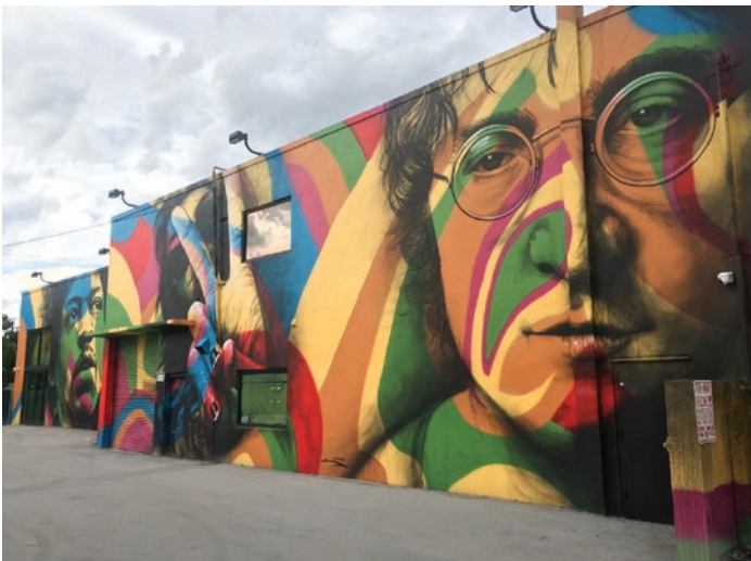
Mural Art on NE 4th Avenue in the Central City CRA