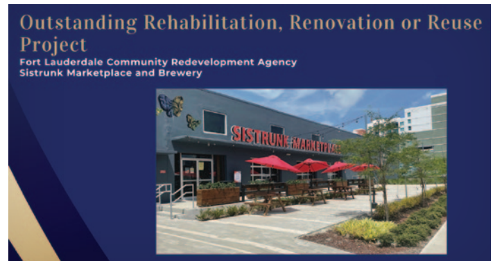
Sistrunk Marketplace and Brewery Award for Outstanding Rehabilitation, Renovation or Reuse Project

Founded in 1974, the Florida Redevelopment Association (FRA) is a not-for-profit organization dedicated to assisting Florida professionals and volunteers in community revitalization efforts. With a mission of "transforming spaces and revitalizing places", the organization has more than 300 members representing the over 220 Community Redevelopment Agencies throughout the State of Florida. Knowledge and common experiences are shared regarding revitalization opportunities and issues, identifying best practices, legal and financial tools, and programs favorable to community growth and serves as a statewide clearinghouse for redevelopment information. During the Association's annual banquet, the Fort Lauderdale Community Redevelopment Agency received the 2022 Roy F. Kenzie Award for Outstanding New Building for the L.A. Lee YMCA/Mizell Community Center and for Outstanding Rehabilitation/Renovation/Project for the Sistrunk Marketplace and Brewery Project.