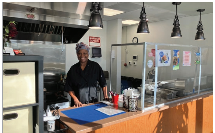
Photo of Blue Tree Café Restaurant

square foot base rent in consideration of CRA assistance in funding and tenant match at the property.