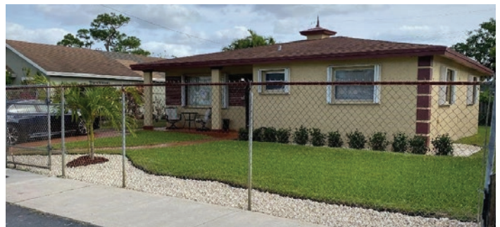
Completion of a home renovated through a pilot program with Rebuilding Together Broward County, Inc.