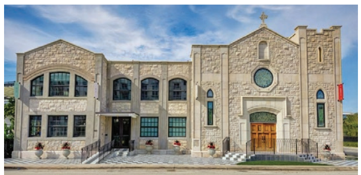
Completion of Holly Blue Restaurant and The Angeles