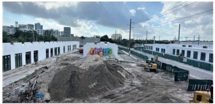
Construction of the Thrive Progresso project in FY 2022

NW 19 Terrace (Property ID 5042 04 18 0220), 720 NW 19 Terrace (Property ID 5042 04 18 0230), NW 9 Street (Property ID 5042 04 32 0040), NW 20 Avenue (Property ID 5042 04 32 0050), NW 8 Street (Property ID 5042 04 32 0060), 740 NW 10 Terrace (Property ID 4942 34 06 7960) and NW 8 Street (Property ID 4942 34 06 7980).