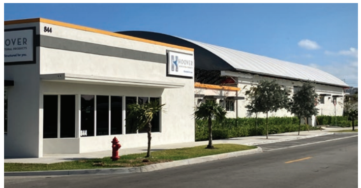
Completion of the renovation and expansion of Hoover Architectural Products offices