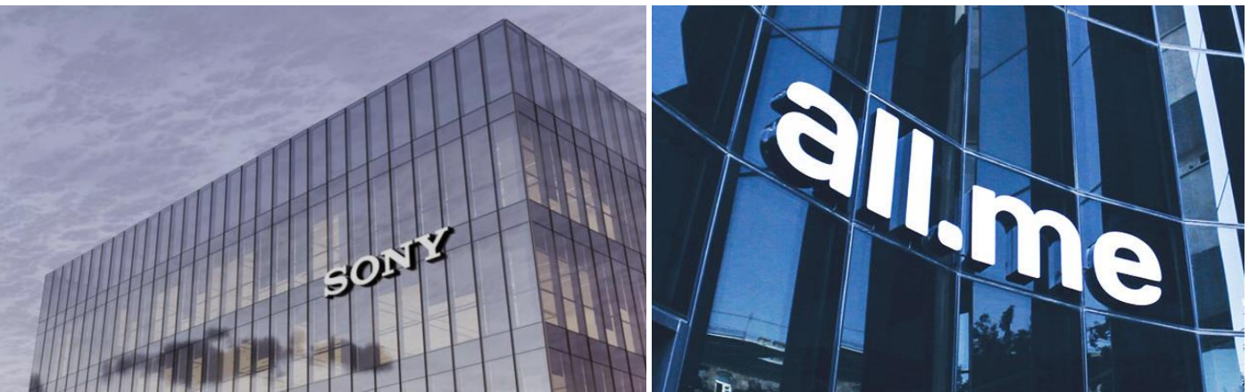
Building ID Sign Examples on Curtainwalls Without Visible Raceways or Support Structures