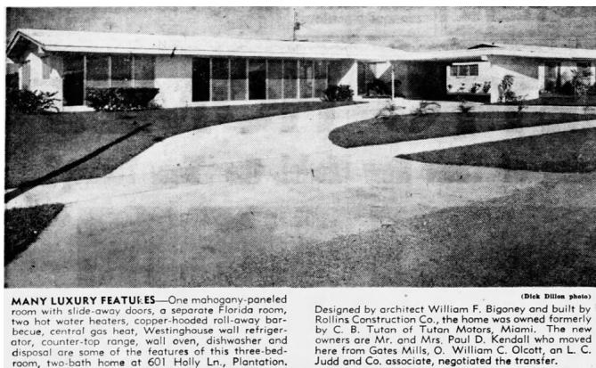
Source: "Group of Model Homes Being Constructed in Southwest Section's New Gill Isles," Fort Lauderdale News, June 29, 1957. Style