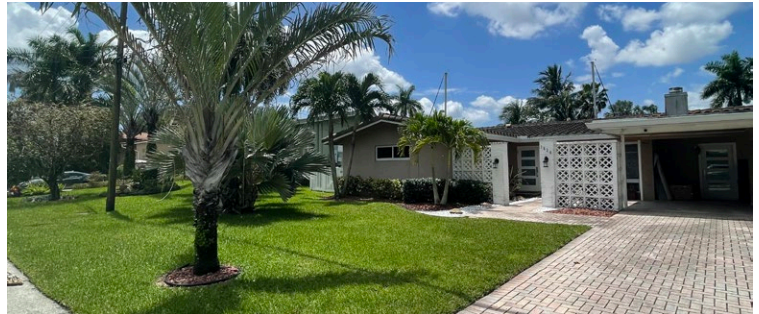
Source: "Advertisement—New Gill Isles," Fort Lauderdale News, June 29, 1957.