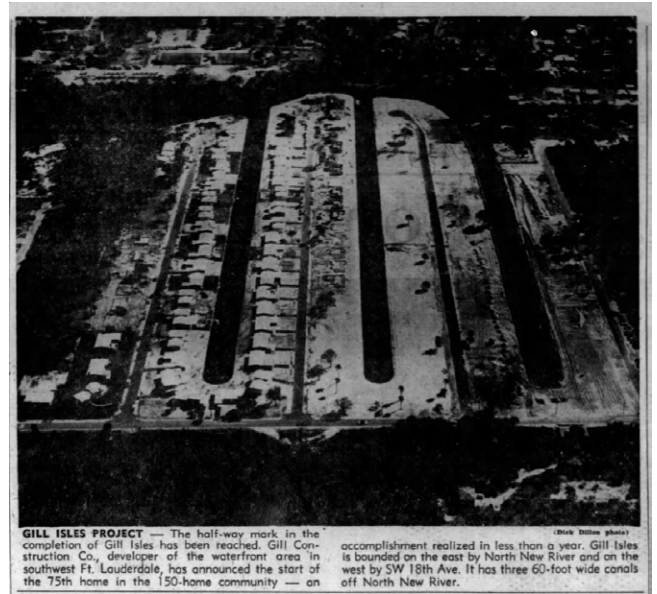
Source: "Gill Isles Project," Fort Lauderdale News, February 1, 1958.