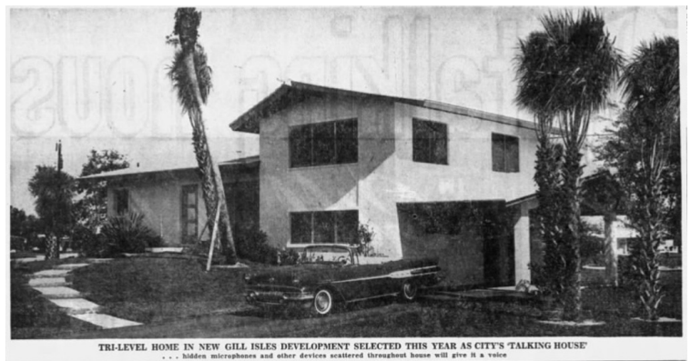
Source: "Row of Waterfront Homes," Fort Lauderdale News, January 17, 1959. Source: "Talking House" Built in Gill Isles," Fort Lauderdale News, October 20, 1957.