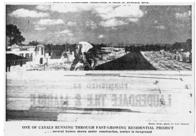
Source: "Gill Isles Builds Up," Fort Lauderdale News, October 20, 1957.