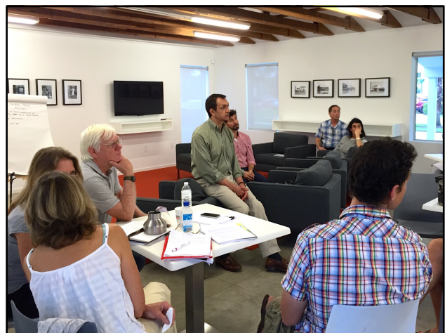
Commissioner Trantalis listens to residents during a recent town hall forum on historic preservation and development in the Sailboat Bend neighborhood.