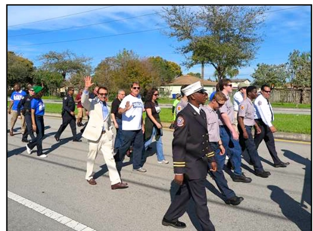
Commissioner Trantalis marches with Mayor Jack Seiler during the recent Martin Luther King Jr. Day parade.