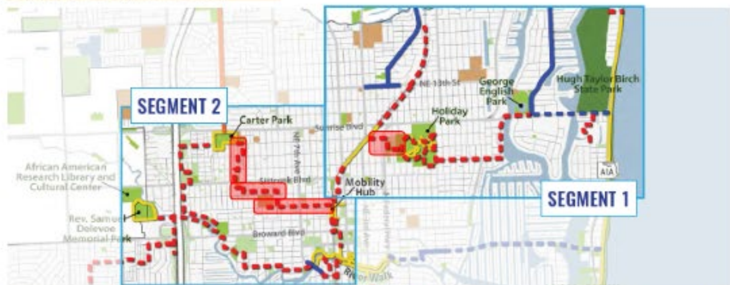
Segment 1 & Segment 2 Map

Programmed bicycle or pedestrian improvements